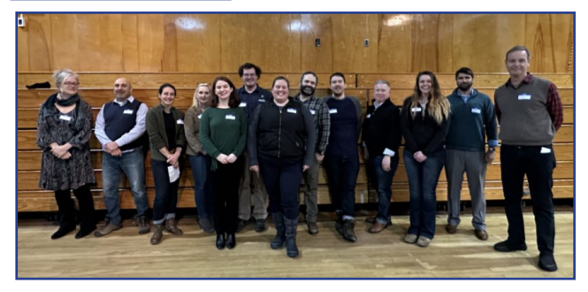
Boquet Valley Monthly Newsletter: April 2023