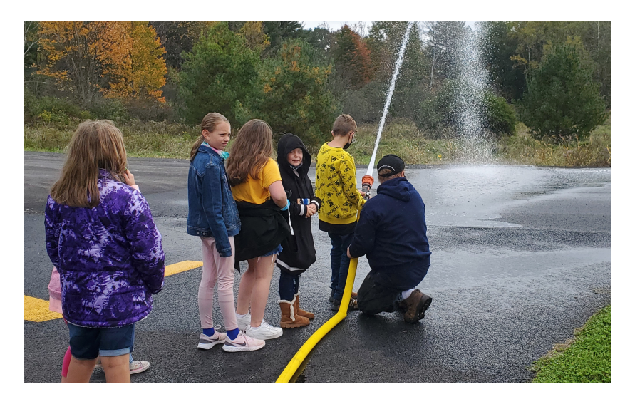
LAKE VIEW CELEBRATED FIRE PREVENTION WEEK AT THE WESTPORT FIRE DEPT.