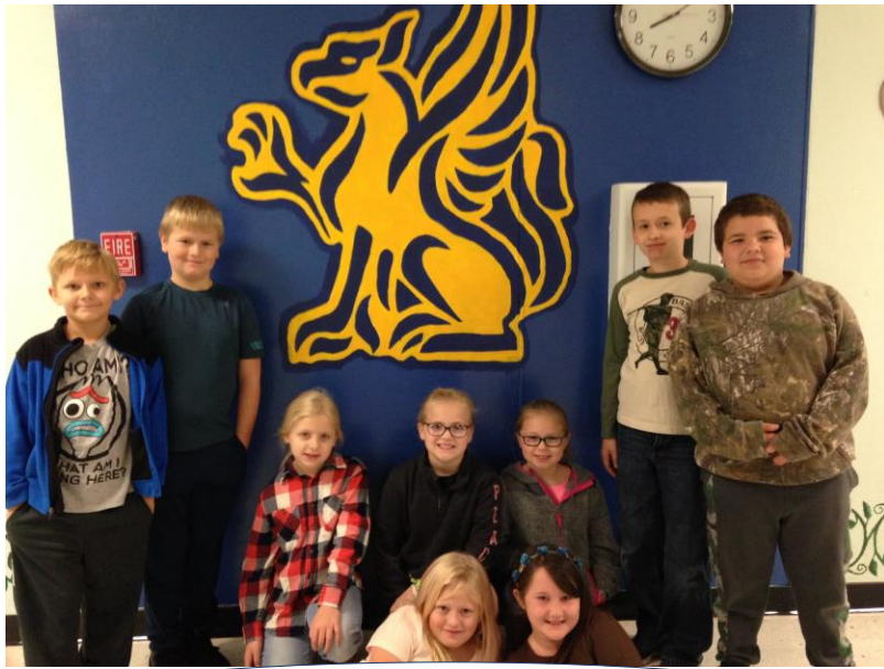
Mountain View Students in front of one of the new murals

Our K-5 teachers had an opportunity to meet with their counterparts at the Lake View campus to review district wide math data as well as working together to prepare for the upcoming changes to the state curriculum. Our 7-12 teachers on that afternoon met at Mountain View providing us time to meet as curricular departments to plan for upcoming regents and curricular changes. Departments also had the opportunity to learn from our Model Schools trainer how to use various components of Google Classroom.