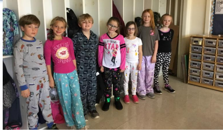
3rd Grade students enjoying Pajama Day of Spirit Week