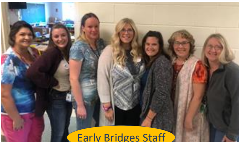
Early Bridges Staff