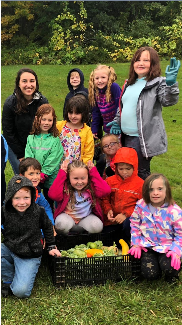
Farm to table instruction with our first grade students

At Boquet Valley we are making strides and specifically planning to ensure our elementary students have access to a wide range of learning experiences. Music, both instrumental and vocal, Art, Technology, Physical Education and Character Education are all parts of our instruction design.