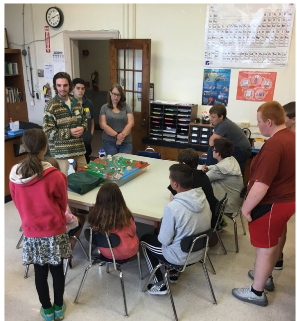
We welcomed our Sea Grant instructors (above) into Mrs. Loher's class for a presentation. Students will be on field trips next week as they study water tables.

A special message to our parents of Early Bridges: the entire preschool staff is thankful and appreciative of all the parents and children. We feel very blessed to be able to be a part of your lives.